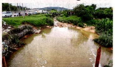
Drones can help detect illegal dumpsites and activities along riverbanks. - Filipco