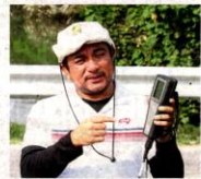
Dr Zaki says enforcement to catch polluters should not stop at only using drones.