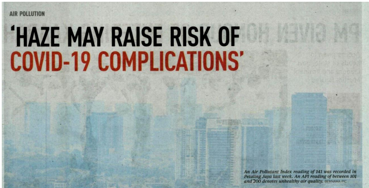
An Air Pollutant Index reading of 141 was recorded in Petaling Jaya last week. An API reading of between 101 and 200 denotes unhealthy air quality.

Those exposed to air pollution should be prioritised for vaccination, says expert