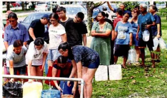
Unscheduled water disruptions cause hardship to the people and businesses, like this scene in December 2019.

improved enforcement. "Budget hotels do not have big water tanks and we rely heavily on direct water supply. "During unscheduled water cuts, some of our members have had to close operations," she added. Residents living near rivers and involved in river preservation programmes also support the initiative. AU2 Keramat Community Garden chairman Mohamad Halim