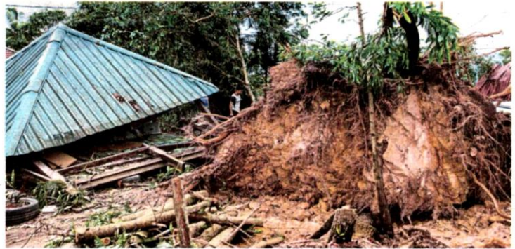
Penduduk membersihkan pokok tumbang akibat dilanda ribut di Taman Seroja Bandar Baru Salak Tinggi, petang kelmarin

"Bagaimanapun, tiada penduduk ditempatkan di pusat pemindahan sementara, manakala kerja membersihkan pokok tumbang disambung, hari ini (semalam)," katanya.