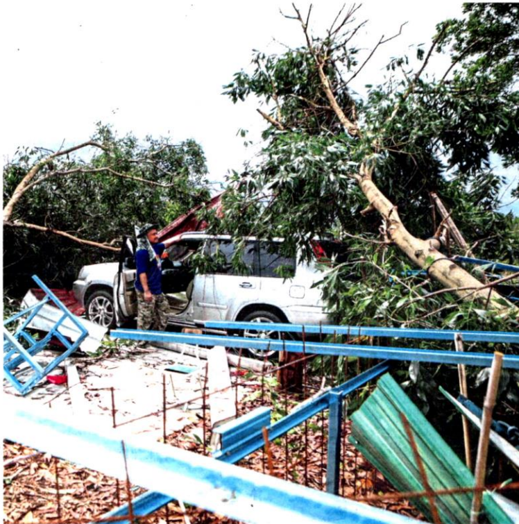
RIBUT yang merosakkan kira-kira 100 rumah di BBST Zon Utara dan Zon Salak, kelmarin adalah kali pertama berlaku di kawasan itu.